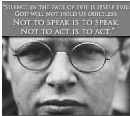
- Dietrich Bonhoeffer

“Being a Christian is less about cautiously avoiding sin than about courageously and actively doing God’s will.” (Bonhoeffer)